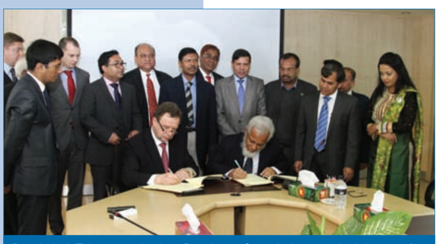
Bangladesh Telecommunications Regulatory Commission – on the joint use of Intersputnik's frequency assignments ●●●

Intersputnik's commercialization accelerated as a result of the events that occurred in the late 1980s and early 1990s, when the socialist bloc and then the Soviet Union fell apart. Few