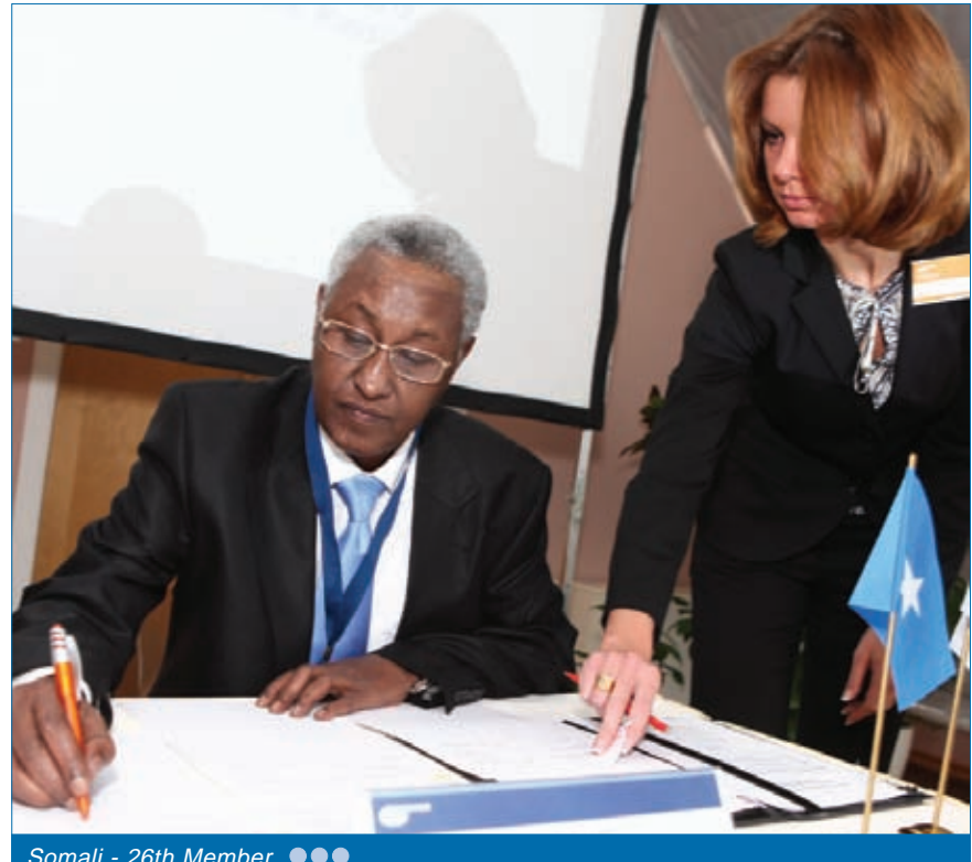
Somali - 26th Member ●●●

Vadim Belov: We plan to draw more partners to supply satellite resources, expand geographically, in the first place, in the Asia-Pacific region and Southeast Asia; continue filing additional orbital slots and use them to implement satellite projects with interested partners; procure and develop our own space segment; diversify services provided by Isatel. We think that our plans are quite realistic and serve as a basis for Intersputnik's further growth.